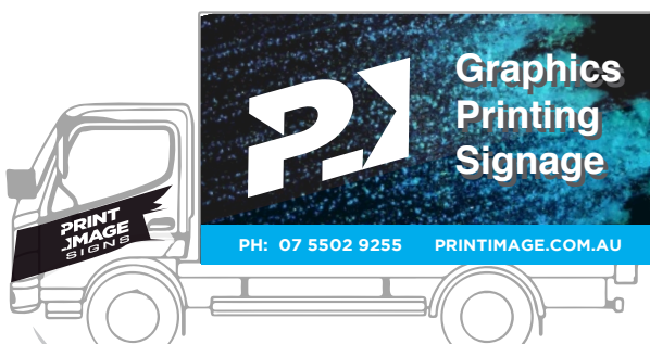
Box Truck Signage Pack 04 PARTIAL WRAP